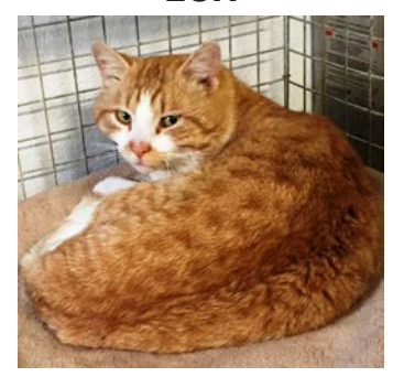
Lox was hanging around the synagogue in Pottstown (that's how he got his name!) It didn't take long for someone to see past the FIV initials & fall in love with his personality. Lox was adopted from PetValu in Audubon.