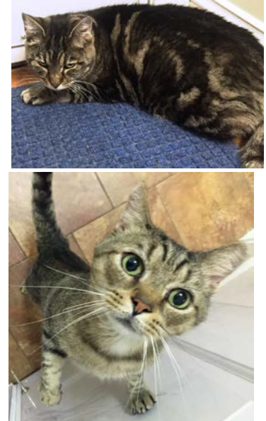
Our first double FIV adoption. Kirk & Max came from the Forgotten Cats Clinic in Willow Grove. Kirk is the outgoing one while Max tends to be reserved. These formerly homeless cats now live in the affluent Chester Springs area & are thoroughly spoiled.